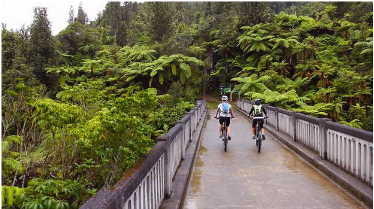
The Bridge to Nowhere in more recent times.